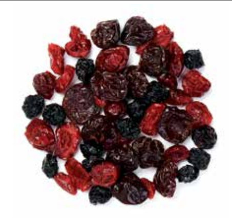
SWEETENED* CHERRY BERRY BLEND cherry, cranberry & blueberry

\begin{bmatrix} 1 & 2 & 3 & 4 \\ \text{Proportionate scale in inches.} \end{bmatrix}