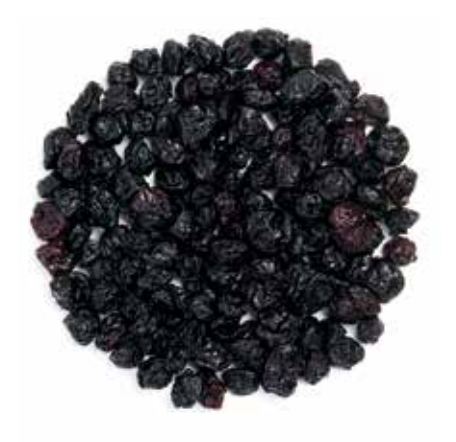
SWEETENED (W/APPLE JUICE CONCENTRATE)