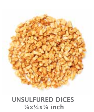
Oregon Tilth Certified Organic Dried Apples