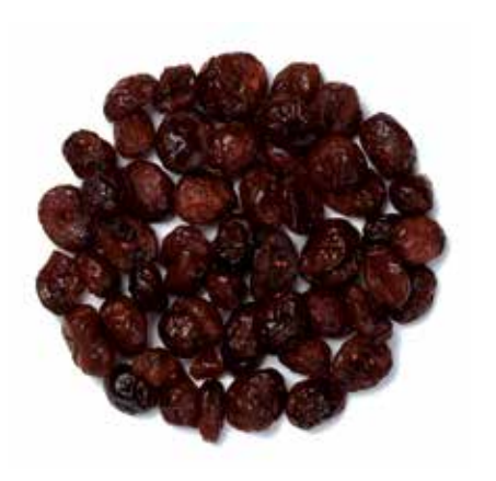
SWEETENED SLICED (W/APPLE JUICE CONCENTRATE)