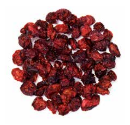
NO ADDED SUGAR SLICED