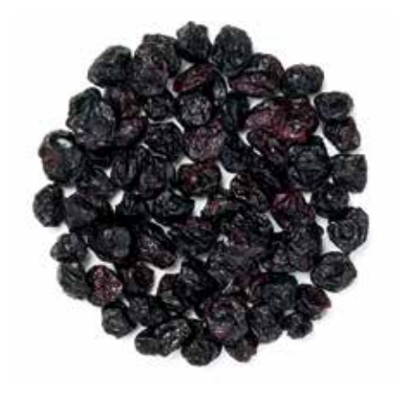
SWEETENED* LARGE CULTIVATED