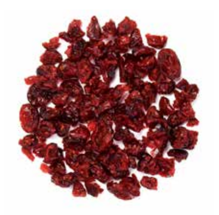
SWEETENED* DICED 3/16x1/4 inch