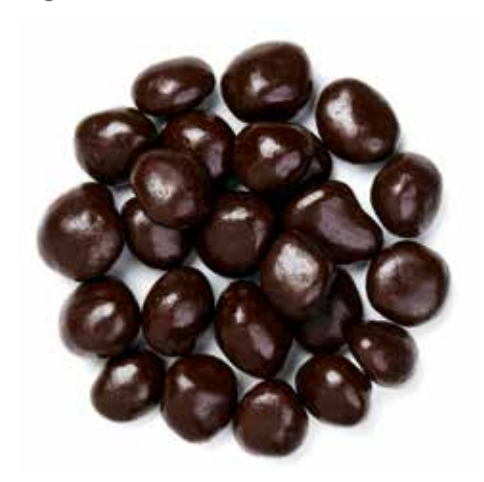
DARK CHOCOLATE COATED MONTMORENCY