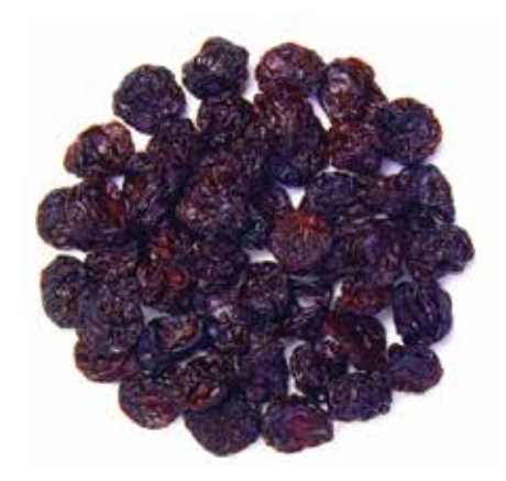
NO ADDED SUGAR TART MONTMORENCY