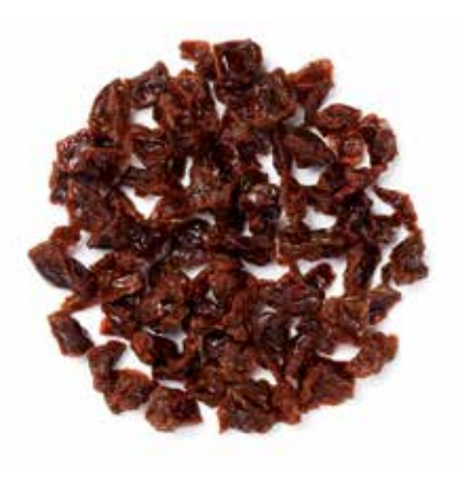
SWEETENED* DICED MONTMORENCY 3/16 x 1/4 inch