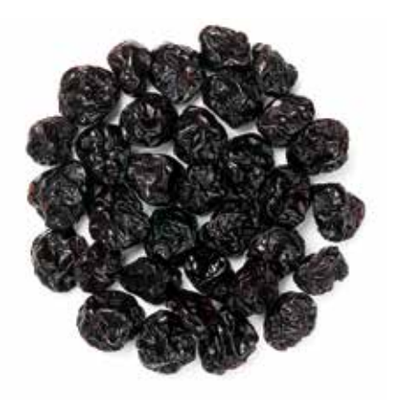
SWEETENED* TART BALATON