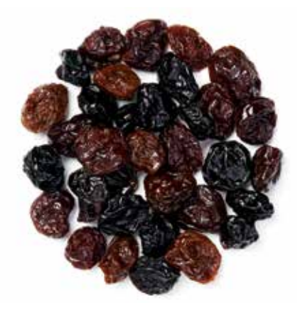
SWEETENED* CHERRY JUBILEE Montmorency, Balaton & Light Sweet