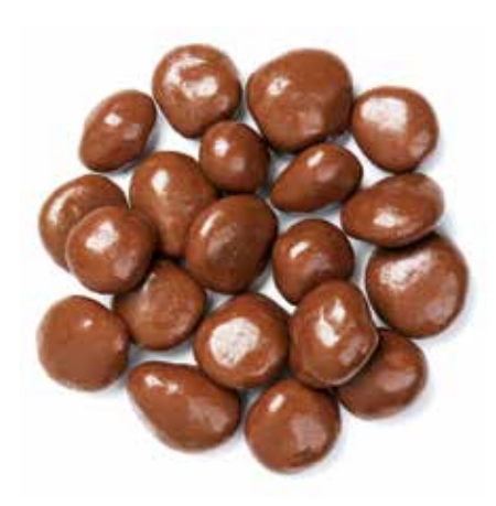
MILK CHOCOLATE COATED MONTMORENCY