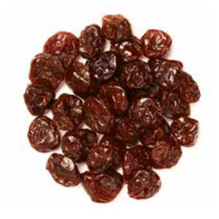
SWEETENED* TART MONTMORENCY