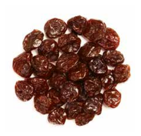
SWEETENED (W/APPLE JUICE CONCENTRATE) TART MONTMORENCY